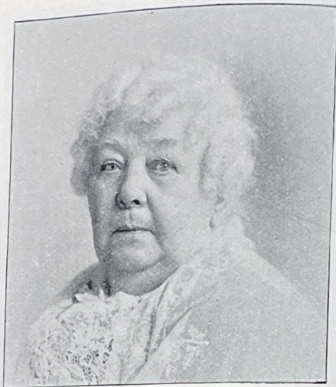
MRS. ELIZABETH CADY STANTON.

Noted Woman Suffragist, Lecturer, and Author.