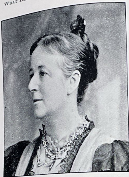
MRS. LAURA ORMISTON CHANT.

Philanthropist, Reformer, Lecturer, Composer and Author.