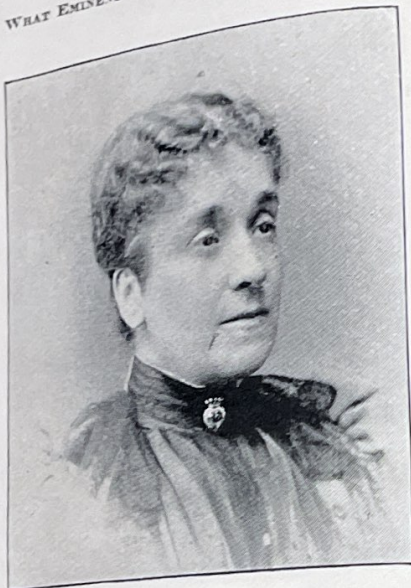
LADY HENRY SOMERSET.

Philanthropist, President National British Temperance Association, President World's Christian Temperance Union, established and edited "Woman's Signal"