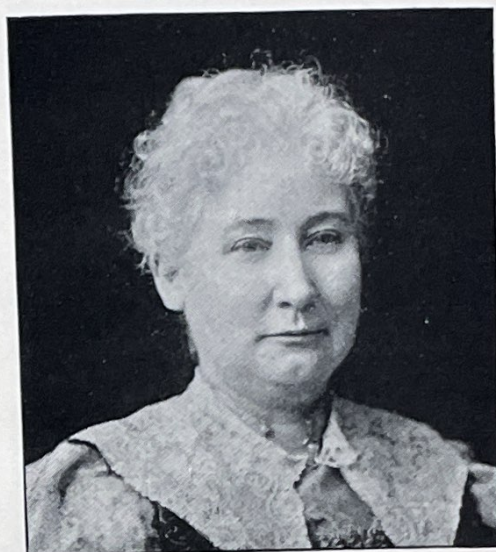
MRS. MAY WRIGHT SEWALL.

"Many a young life is shipwrecked for want of knowledge of the right sacred sort. This book is pre-eminently religious, scientific and common-sensed."