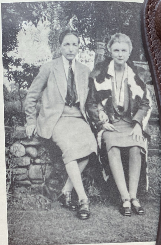
Radclyffe Hall and Una Troubridge in Edy C Garden at Smallhythe 1931.