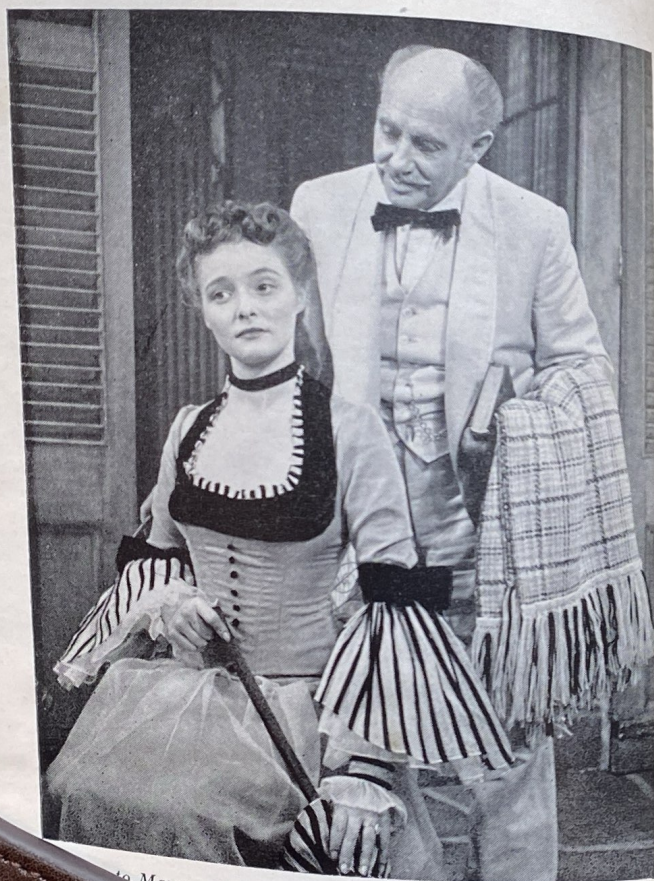
to Marcus: Let's take our lunch and go on a picnic, just