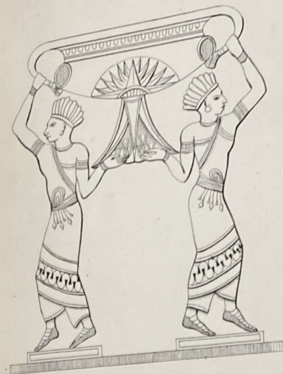
GOLDEN VASE SUPPORTED BY TWO PHILISTINES, From a Picture in the Tomb of Ramses IV.