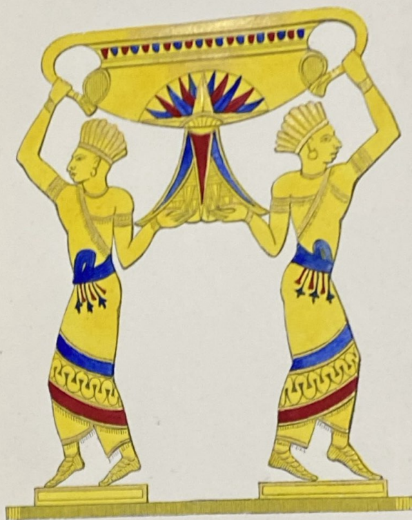
GOLDEN VASE SUPPORTED BY TWO PHILISTINES, FROM A PICTURE IN THE TOMB OF RAMSES IV.