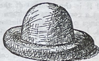
French Pessary—slightly different from the American.

They come in three sizes—large, medium and small. It is well to get the medium size, as the small ones are only for very small boned women and easily get out of place.